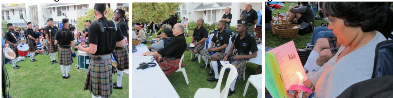
Right: The Band plays all-time favourite tunes for those who have come to remember. Middle: Emotions let loose when we look up as the lights go on. Right: Singing Carols as it grows dark allowing the brilliantly lit tree to illuminate all around us.