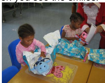
One of the homes-note the teddies