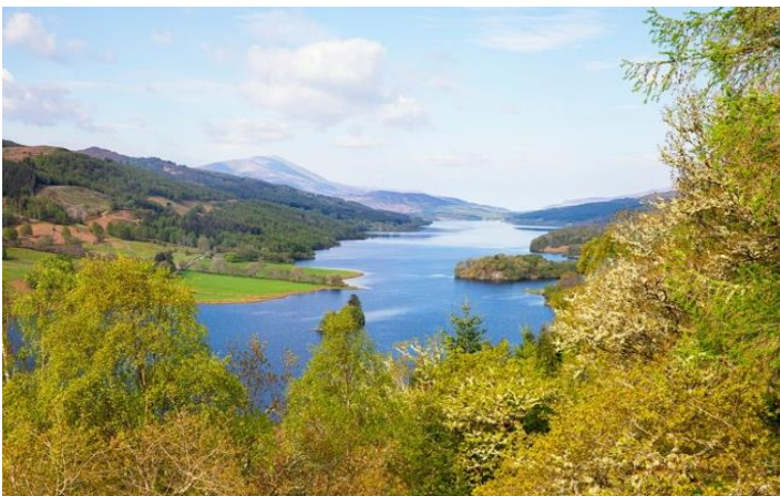
Loch Coruisk, Elgol