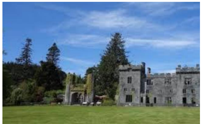
Armadale Castle & visitor centre

One of the largest and most powerful Highland clans, Clan MacDonald traces its origins to Somerled, a 12th-century warlord of Norse-Gaelic heritage who carved out a kingdom along Scotland's western seaboard. From this foundation, the MacDonalds rose to become the famed Lords of the Isles, controlling vast stretches of the Hebrides and western Highlands for generations. At their height, they operated almost as semi-independent rulers, commanding fleets and armies that rivalled those of the Scottish crown. The Clan Donald Visitor Centre, located at Armadale Castle, on the Sleat Peninsula, Isle of Skye, is well worth a visit and the history of the clan is covered in detail. I went thinking an hour or so would be enough time, but I ended spending an entire afternoon until closing time!