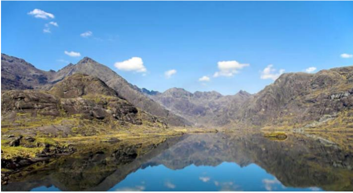
Queen's View, Perthshire